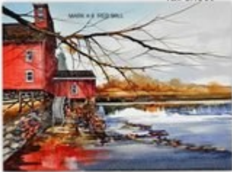
MARK 8:30 TO 4:30