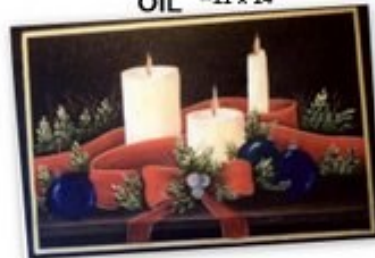
ARLEE 8:30 TO 12:30