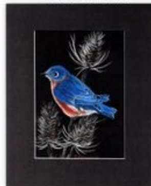
SUZI 8:30 TO 12:30