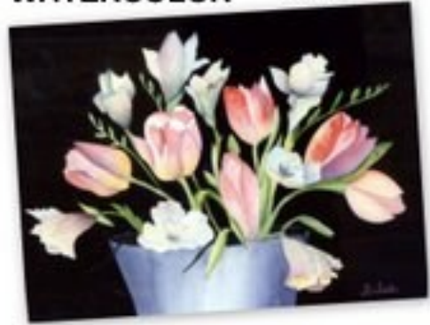
ARLEE 8:30 TO 12:30