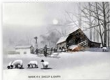
MARK 8:30 TO 4:30