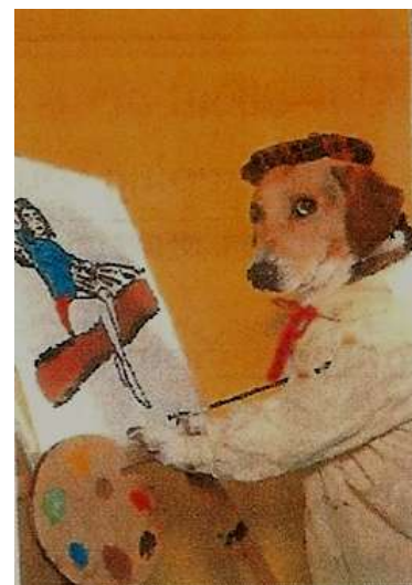
Newest Member of South Central