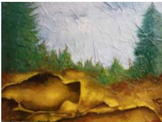
Also from Regina