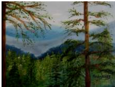
Nona's "Mountain View"