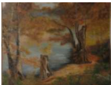
Neva Shaw has finished a landscape