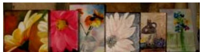
Neva Shaw did a series of small paintings on 6x6 and 5x7 creative edge canvases