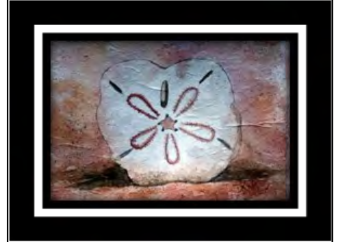
MASA PAPER WATERCOLOR 8X10 DEBORAH NEES