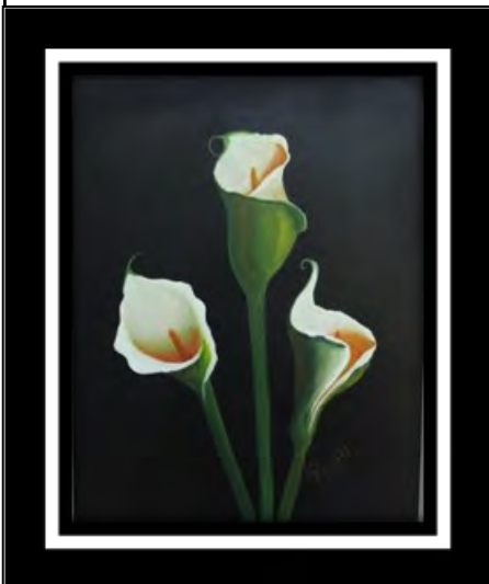
CALLA LILY ACRYLIC 11X14 CHARLENE POWELL