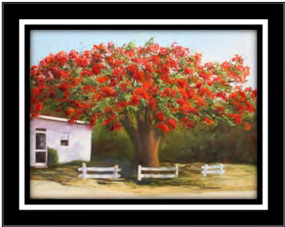
15TH AVE. ROYAL POINCIANA TREE OIL 12X16 DIANA MARCINKA