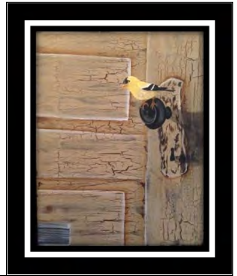
PRECARIOUS PERCH ACRYLIC 11X14 CINDY MAKOWSKI