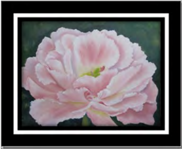
PINK MAJESTY OIL 12X16 PAT APPLING