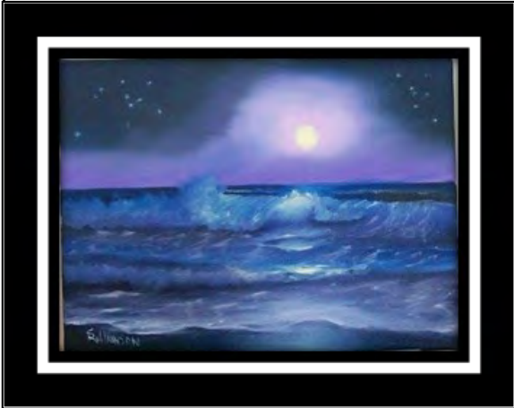
MOONLIGHT WAVE OIL 12X16 SYLVIA WILKINSON