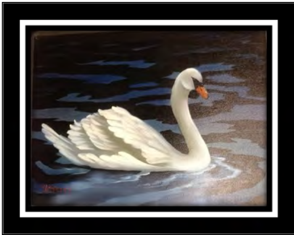
SWAN OIL/ACRYLIC 12X16 PAT HITCHCOCK