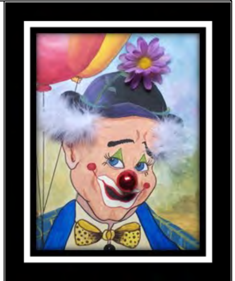
3D CLOWN ACRYLIC 11X14 MARA TRUMBO