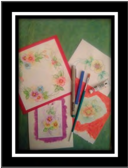
WATERCOLOR ON CARDS BONNIE PHILLIPS