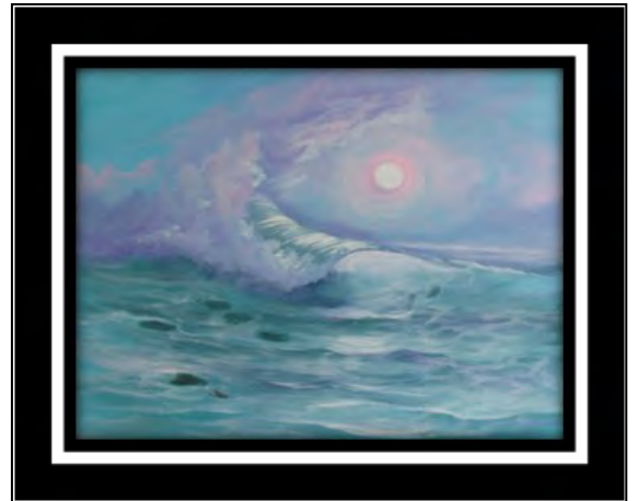
AQUA MIST ACRYLIC 9X12 PAT APPLING