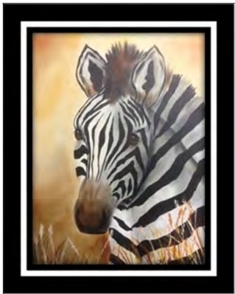
ZEBRA OIL AND ACRYLIC 12X16 PAT HITCHCOCK