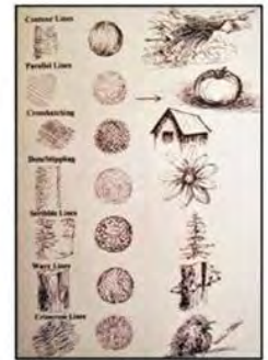
1pm-4pm Pen & Ink