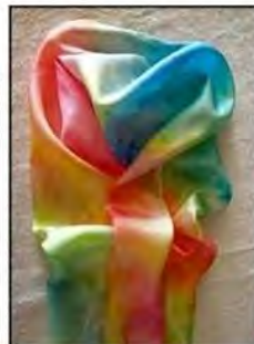
8-11am Alcohol Ink