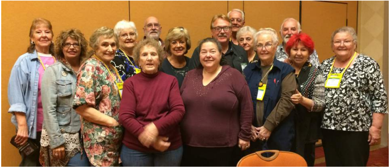
Western Region TEAM at Las Vegas Creative Painting Convention 2016